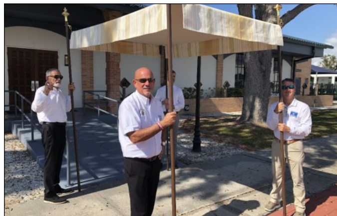
Canopy Bearers - Christ the King 2025